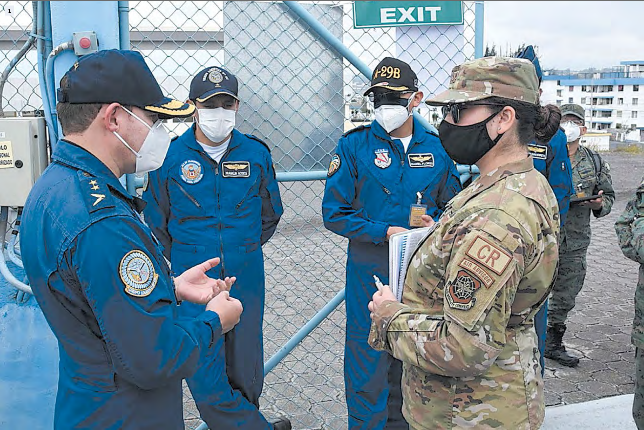
Air Education and Training Command Public Affairs